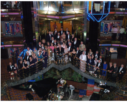
Formal Dinner on Board the Cruise Ship 'Carnival Ecstasy'