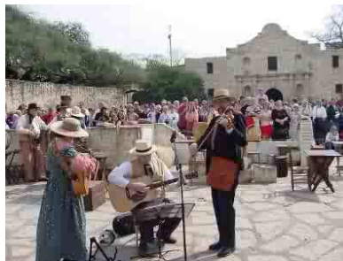
Celtaire performing at the Alamo

Performing live at our September 25, 2006 meeting Invite your friends and relatives