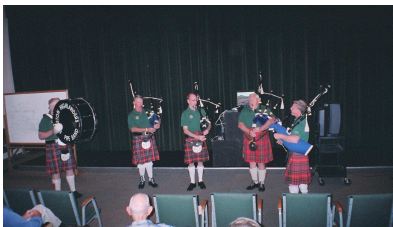
Houston Highlanders at Oct. meeting