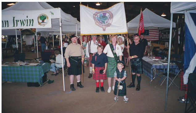
Heather & Thistle members at the Houston Highland Games