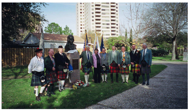
Burns Ceremony at Herman Park Rose Garden