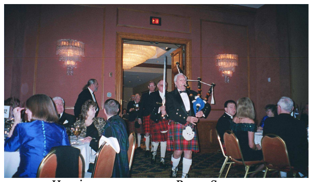
Haggis ceremony 2005 Burns Supper