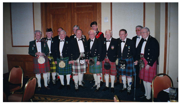
Past Chieftains at 2005 Burns Supper