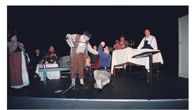
Burns Club performance Feb. 2005 meeting